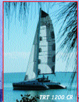
TRT 1200 CR