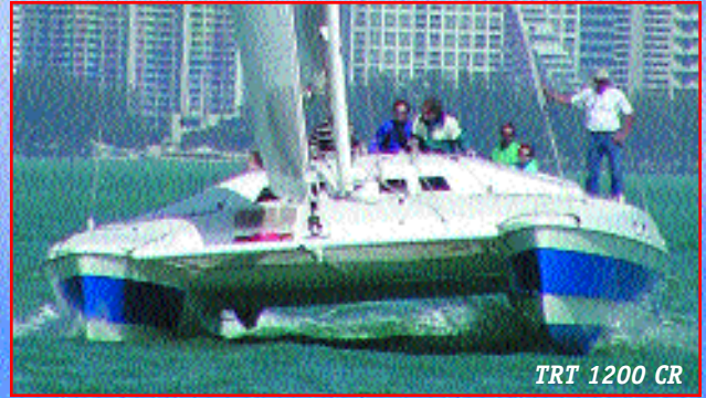
TRT 1200 CR