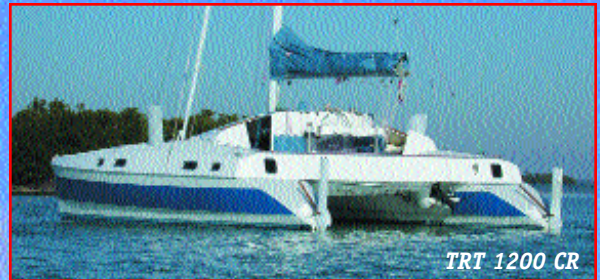
TRT 1200 CR